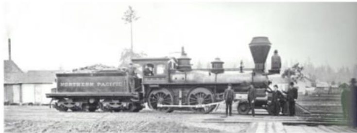
Northern Pacific Train Engine in Spokane, WA, 1884