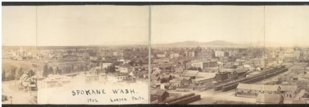
Spokane, WA in 1902: Notice the Court House and Chronicle Building, if you look carefully.