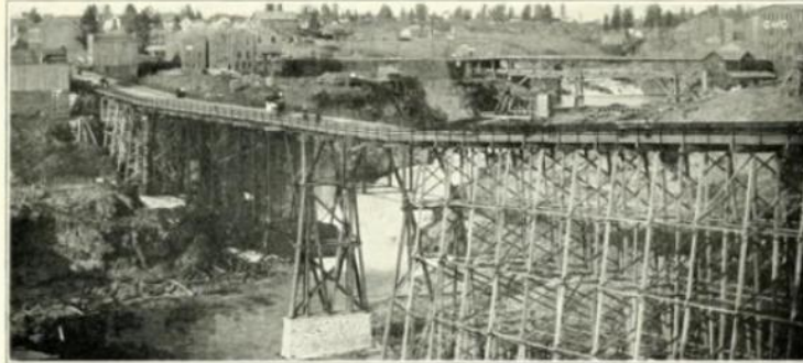
FIRST MONROE STREET BRIDGE, OPENED IN 1889. LATER DESTROYED BY FIRE.