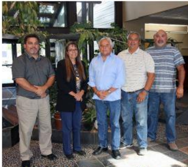
Spokane Tribal Council, 2019

The Spokane Tribe of Indians is a sovereign government body led by the Spokane Tribal Business Council. The Tribal Council consists of five positions: Tribal Chairman, Vice Chairman, Secretary, and two Council Members. The Spokane Tribal Council reports to the General Membership, meaning all enrolled Spokane Tribal Members. The Council and other governmental organizations get their power from the members of the Spokane Tribe. Spring