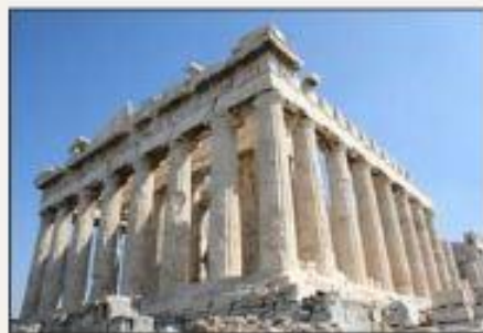
▲ The Parthenon in Athens, Greece.