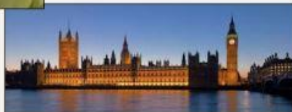
▲ The Houses of Parliament in London, England.