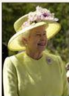
▲ Queen Elizabeth II of the United Kingdom.

The idea of a republic is almost always associated with democracy, but this is not necessarily the case. Consider the case of China. China considers itself a republic and holds elections. However, Chinese citizens are only allowed to vote on candidates from the Communist Party, thus restricting the voting process. Conversely, many democracies are not republics. For instance, Great Britain is one of the world's most famous democracies. Yet, it is not a republic, but a constitutional monarchy since it has a Queen (or King). These two examples simply highlight that words such as republic or democracy may stand for certain ideas, but how these government systems are applied is what matters the most.