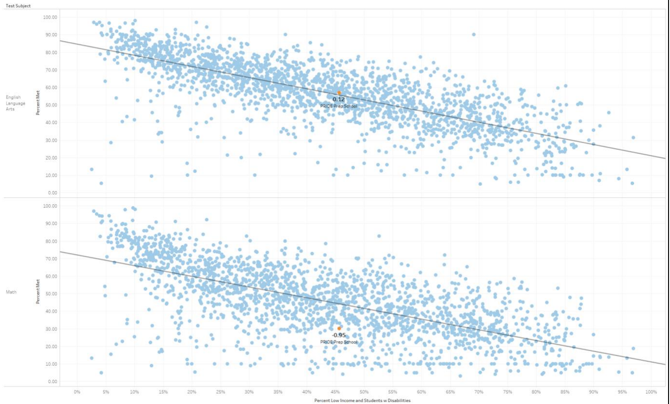
Indicator 3 - Proficiency compared to similar FR and Students with Disabilities - 2018-19